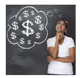
Engage: Get them thinking