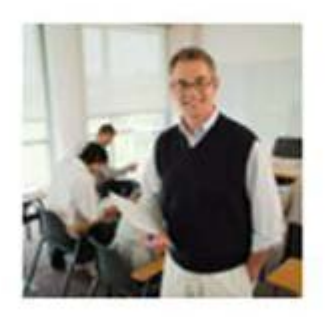
Teach: Share the knowledge