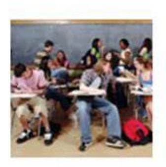
Practice: Use the knowledge