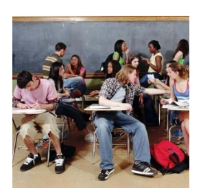
Practice: Use the knowledge