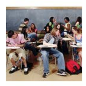
Practice: Use the knowledge