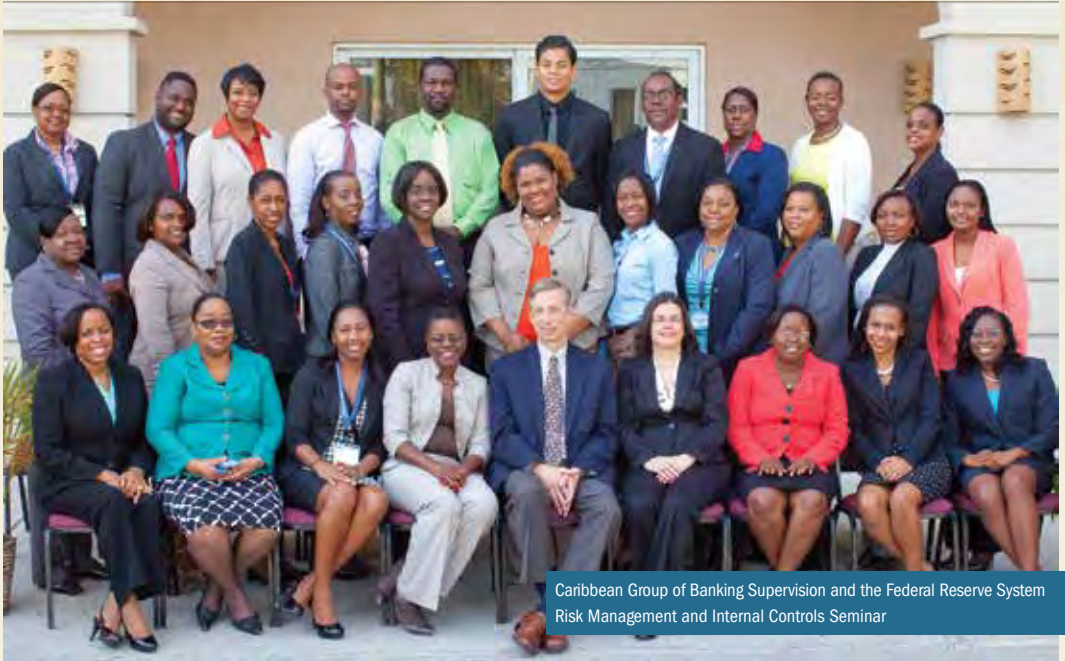
Caribbean Group of Banking Supervision and the Federal Reserve System Risk Management and Internal Controls Seminar