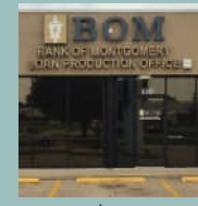
Loan Production Office Alexandria 2016