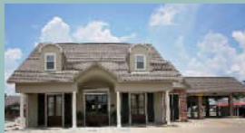
Keyser Branch Natchitoches 2009