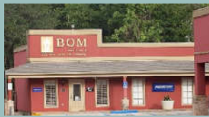
BOM Financial Services Natchitoches 2006