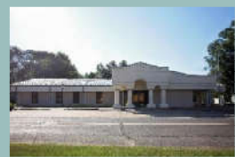
Montgomery Branch 1903