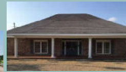
Houghton Branch 2016