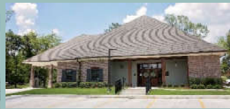
Many Branch 2013